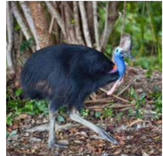
National parks provide a habitat to cassowaries, a threatened yet extremely significant bird for the health of Queensland's rainforests.

In 2017, Galaxy Research found that support for Queensland's national parks remains very strong with 84% of respondents indicating