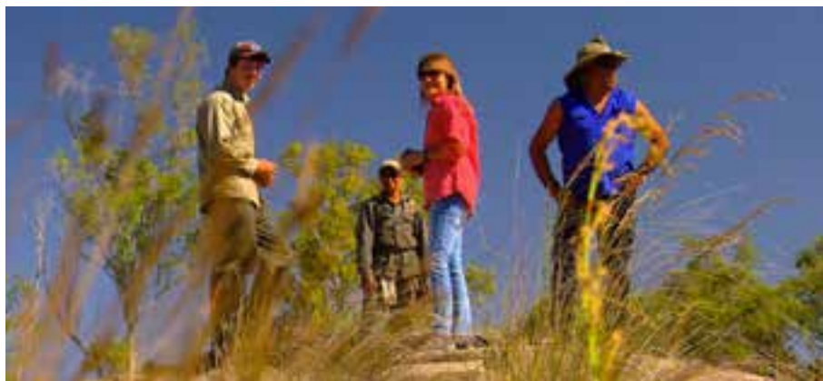
The Talaroo Nature Refuge is managed by Ewamian Traditional Owners. They are excited by the opportunities presented by the Nature Refuges program however are experiencing the under-investment first hand.

For more information on the campaign, or to sign a petition visit: www.outbackqueensland.org.au